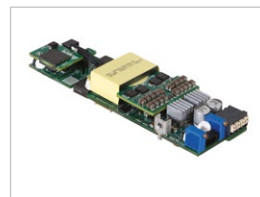
单插槽双输出 (最大 240 W 输出)