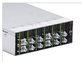
MEG-2K1A6 (6 插槽)