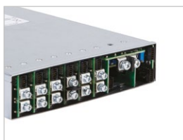
MEG-3K0A9 (9 插槽)