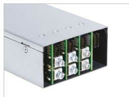
MEG-700A3 (3 插槽)