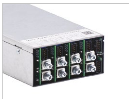
MEG-1K2A4 (4 插槽)