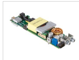
单插槽单输出 (最大 300 W 输出)