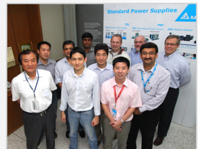
Key Delta Sales Executives from various parts of the world.